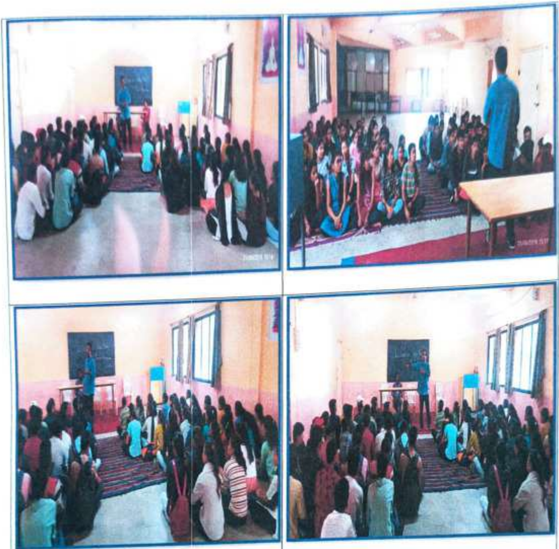
Yoga Day (21/06/2019)