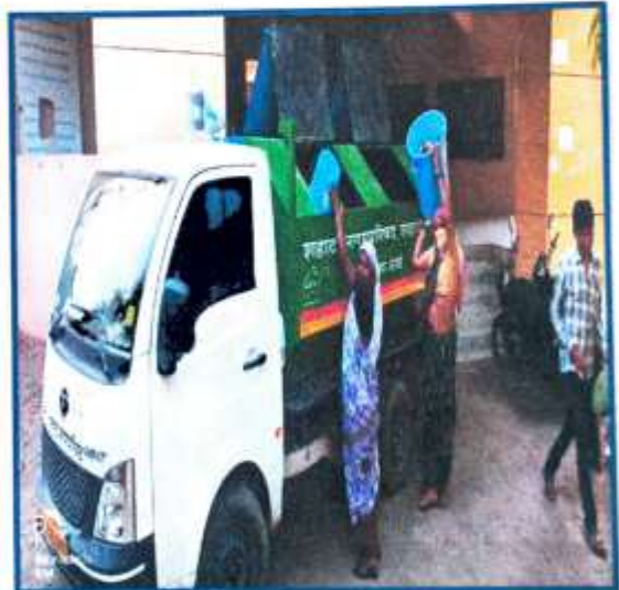
Waste Collection By Municipal Corporation Vehicle