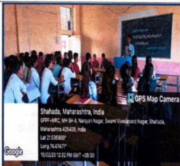
Lecture On Entrepreneurship Program (15/02/2020)