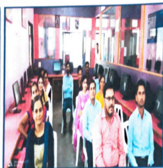
Workshop On Teaching- Learning Through ICT (30-11-2018)