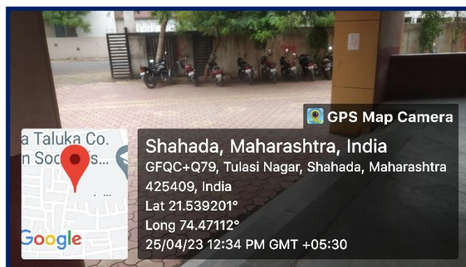
Restricted Entry of automobile in Campus