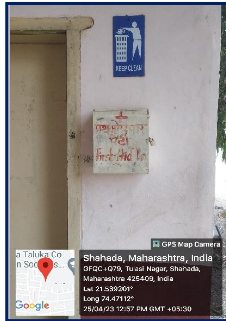
Cleanliness Sign Board in Campus