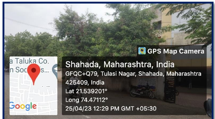
Plantation in Campus